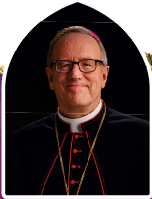
BISHOP ROBERT BARRON